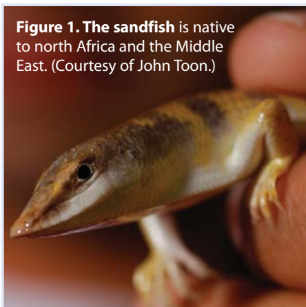
Figure 1. The sandfish is native to north Africa and the Middle East.

Despite hundreds of years of study, scientists do not yet have a comprehensive understanding of the flow and effective solidification of granular media subject to intrusion by a body or leg. One reason is the complexity of grain response to localized forces. For example, granular materials can support loads through the formation of complex force-chain networks, exhibit compressible flow with heterogeneous regions of density and pressure, or even act like gases described by the kinetic theory. (For more, see the article by Anita Mehta, Gary Barker, and Jean-Marc Luck,